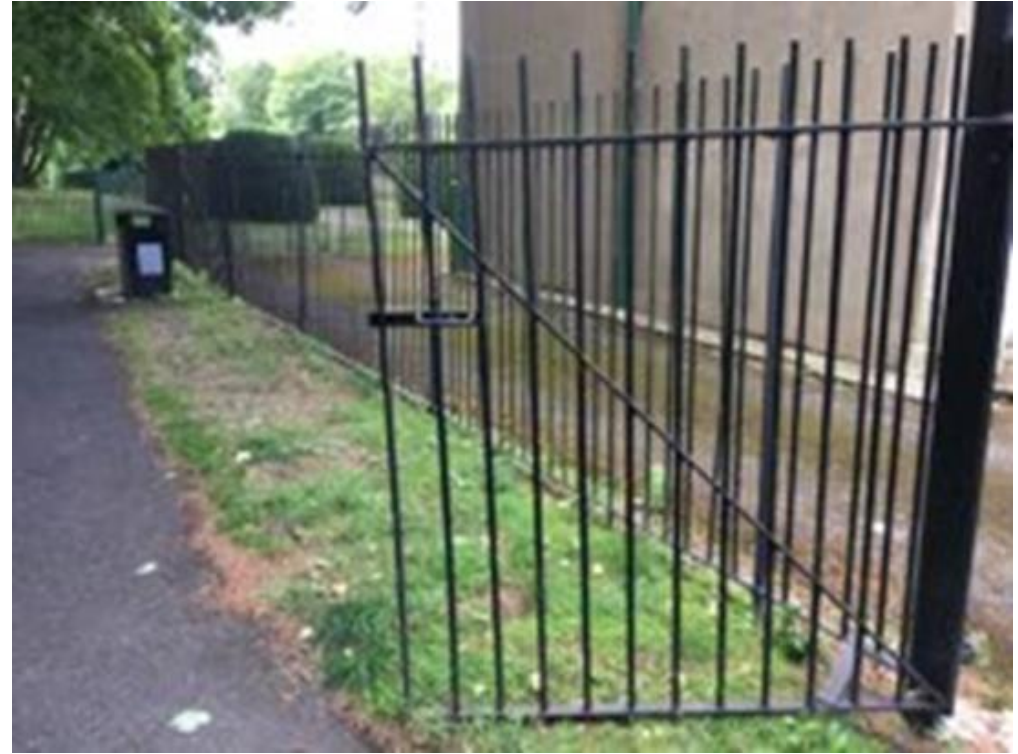
Photo of existing railings to be removed