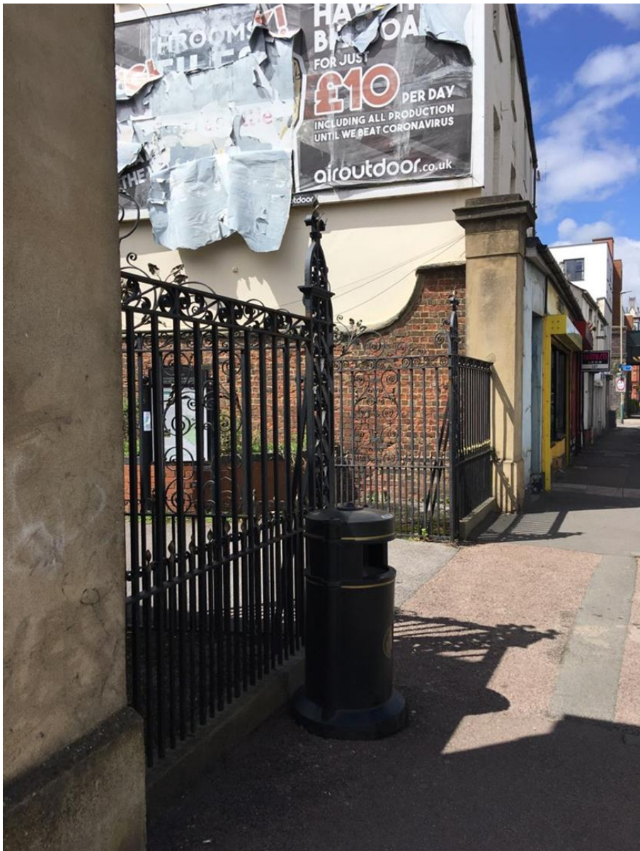
Photo of existing gates