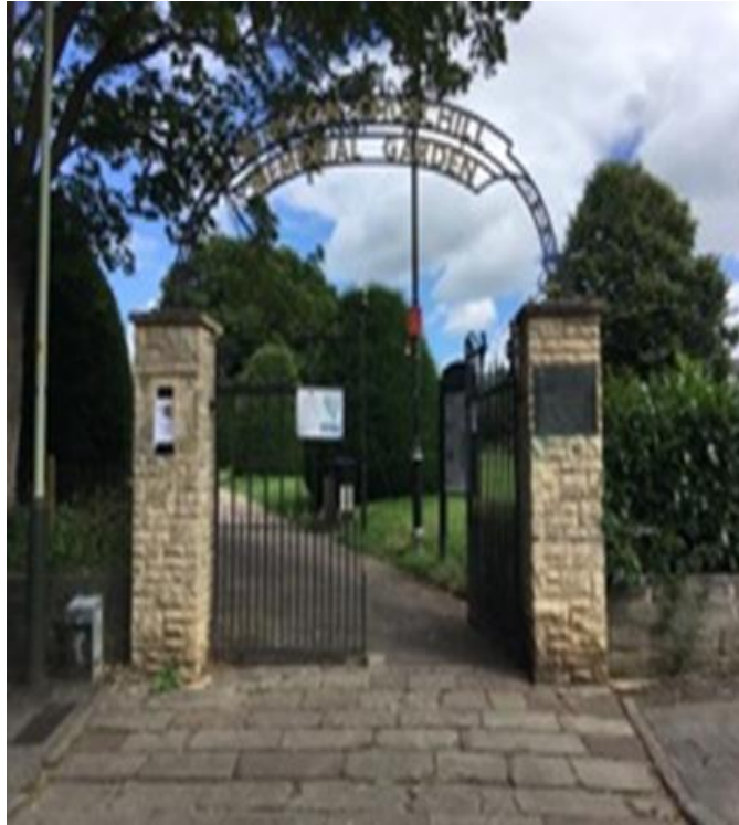
Photo of existing arch way