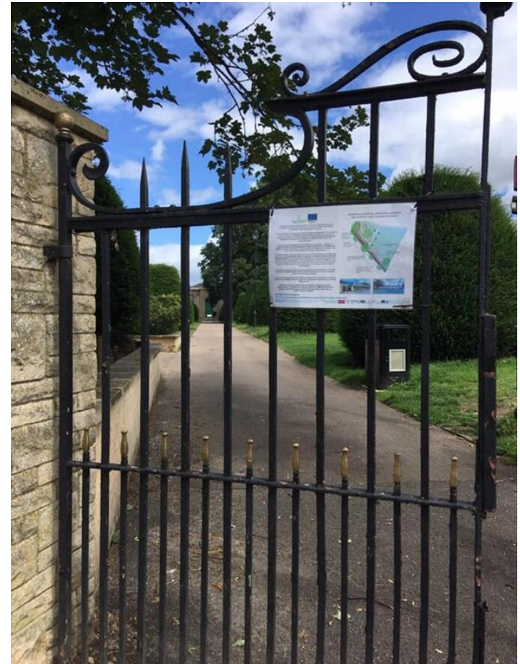
Photo of existing gates