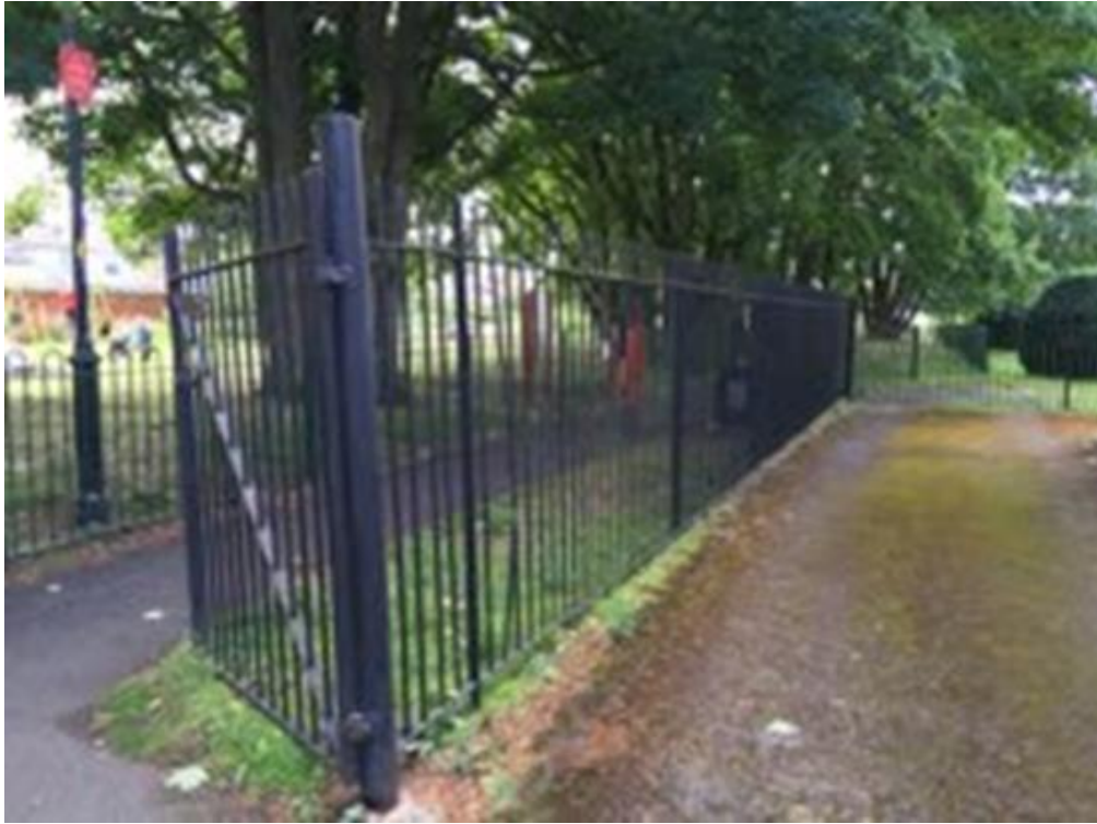
Photo of existing railings to be removed