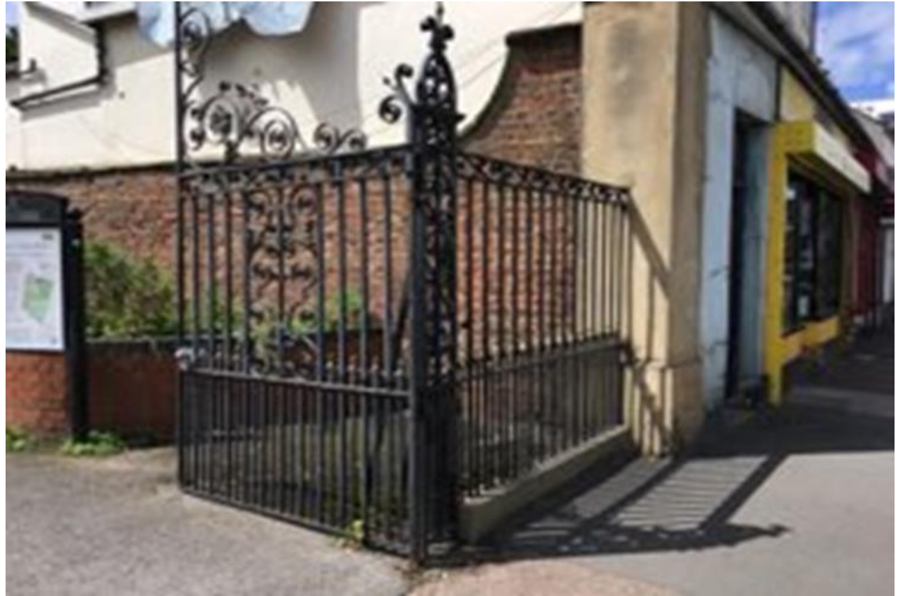
Photo of existing gates